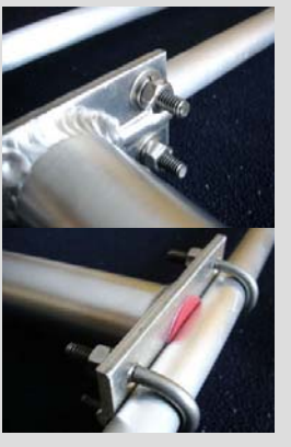
Heavy-duty dipole fixture