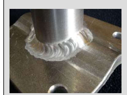
Expert TIG welding