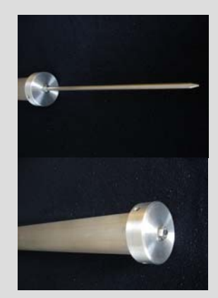
Optional lightning rod