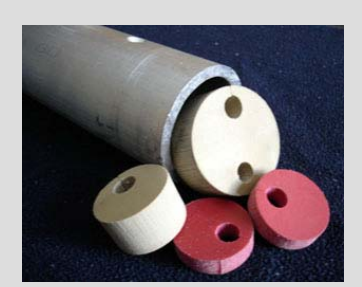
Natural rubber plugs